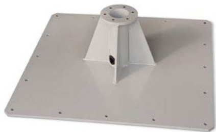
Floor mounted base

Options for heaters with built in remote control are also available.